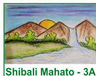
Shibali Mahato - 3A