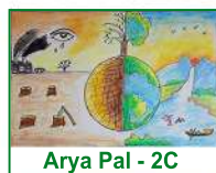
Arya Pal - 2C