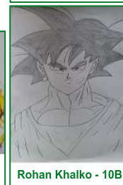
Rohan Khalko - 10B