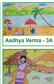
Aadhya Verma - 3A