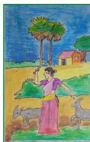
Nishant Mridha - 2C