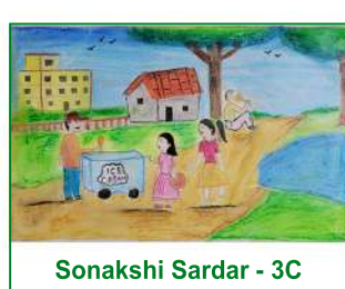
Sonakshi Sardar - 3C