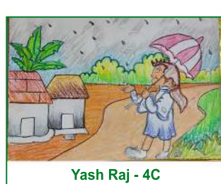
Yash Raj - 4C