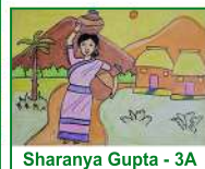
Sharanya Gupta - 3A