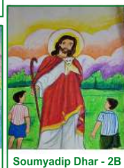
Soumyadip Dhar - 2B